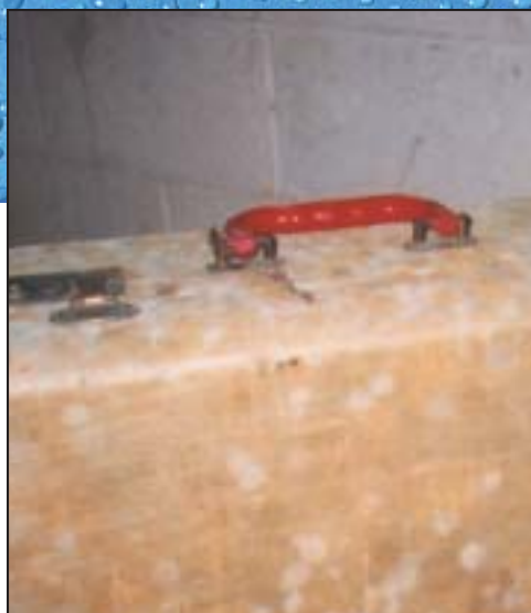
Mold growing on a suitcase stored in a humid basement.

It is important to take precautions to LIMIT YOUR EXPOSURE to mold and mold spores.