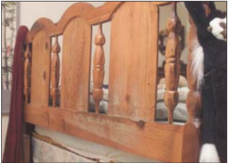
Mold growing on a wooden headboard in a room with high humidity.