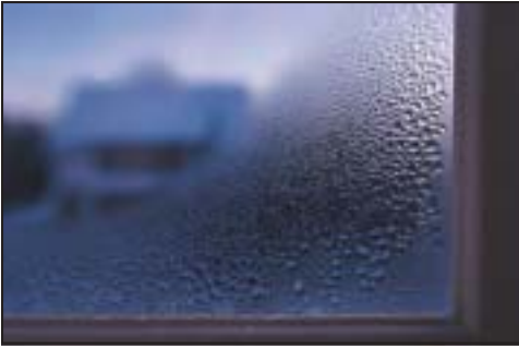
Condensation on the inside of a windowpane.