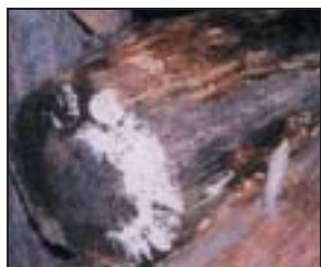
Mold growing outdoors on firewood. Molds come in many colors; both white and black molds are shown here.

Molds are part of the natural environment. Outdoors, molds play a part in nature by breaking down dead organic matter such as fallen leaves and dead trees, but indoors, mold growth should be avoided. Molds reproduce by means of tiny spores; the spores are invisible to the naked eye and float through outdoor and indoor air. Mold may begin growing indoors when mold spores land on surfaces that are wet. There are many types of mold, and none of them will grow without water or moisture.