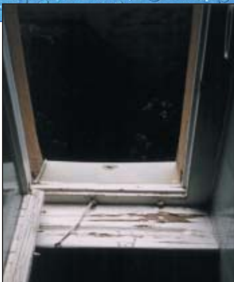
Leaky window – mold is beginning to rot the wooden frame and windowsill.

If you already have a mold problem – ACT QUICKLY.