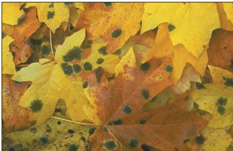
Mold growing on fallen leaves.

This document is available on the Environmental Protection Agency, Indoor Environments Division website at: www.epa.gov/iaq/molds/moldguide.html