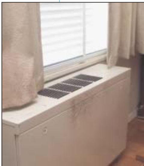
Mold growing on the surface of a unit ventilator.