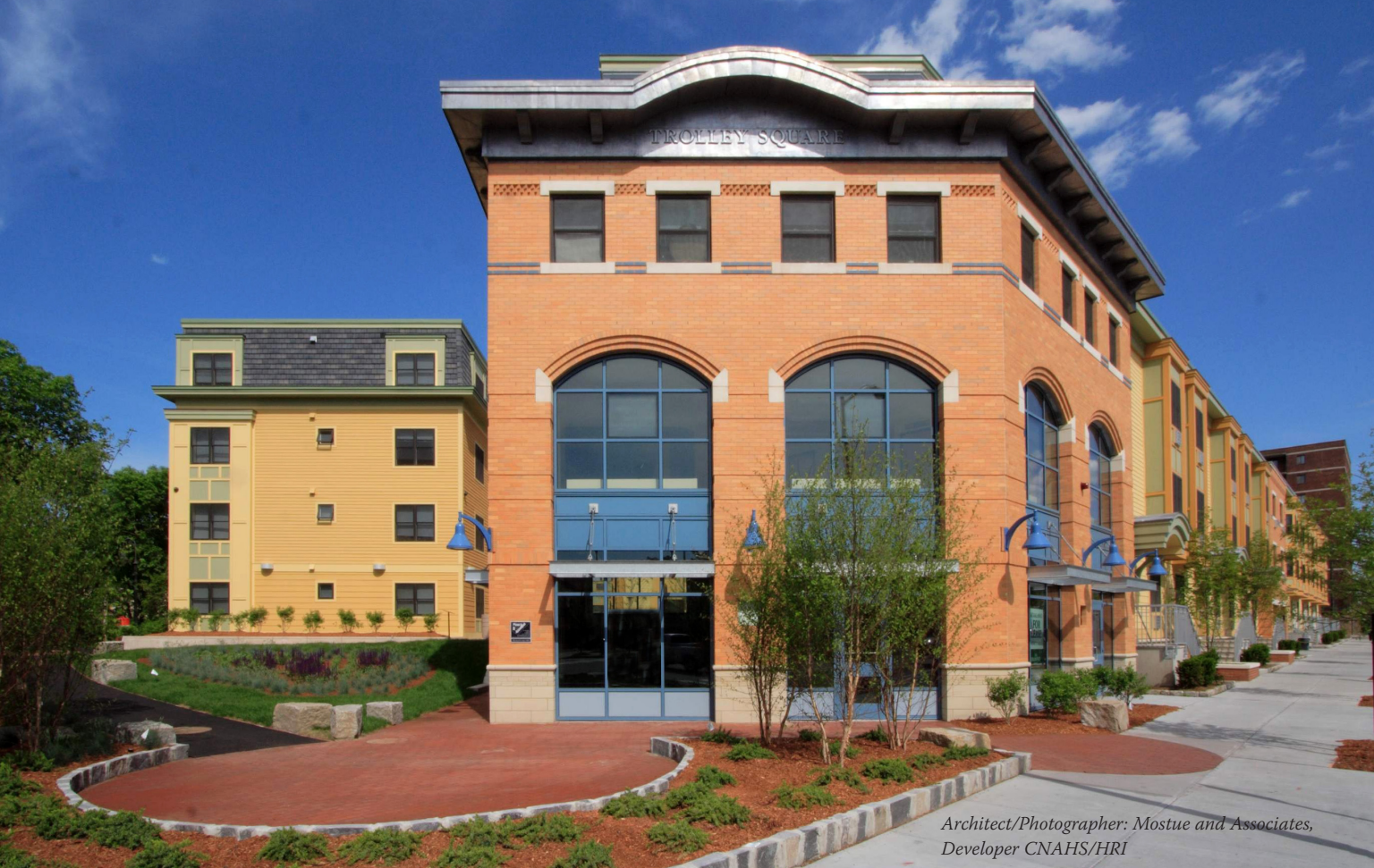
Developer CNAHS/HRI

Join your colleagues and experience the best discussions and the latest ideas in green building, green property management, and green economy!