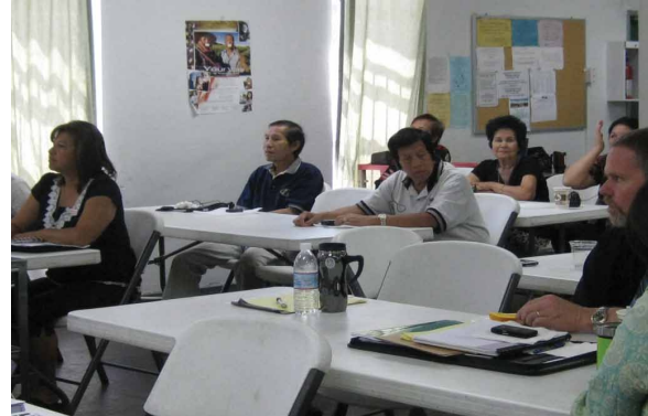
Fresno Community Meeting